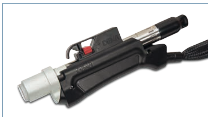
Figure 1. The Moveo handpiece has a built-in skin contact cooling system. The sapphire tip is cooled to 15°C for maximum patient comfort.

Another important issue is related to the optical characteristics of the skin which can cause reflection thus significant laser pulse energy losses. This effect stems from the significant differences between refractive index of the air - through which the laser beam must pass before reaching the skin - and that of the skin itself [7-8] . The innovation DEKA now offers for photoepilation is the new handpiece with Moveo technology (figure 1) which decreases the two issues mentioned above.