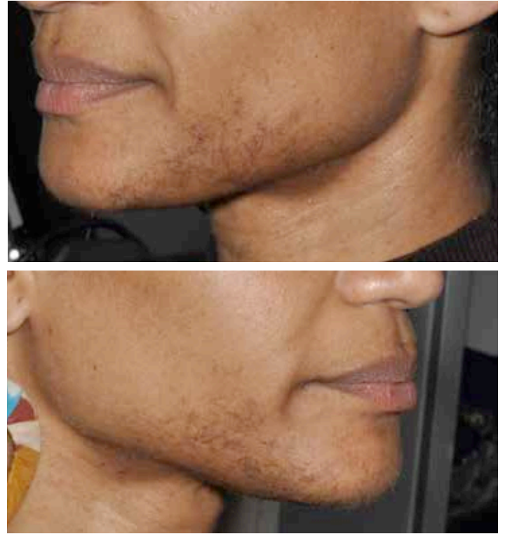
Figure 6. Case 2. Before treatment (24 April 2015).

hairs were much finer and regrowth had slowed. In subsequent sessions, performed 1 month and a half/two months apart, a significant hair reduction was seen. At the present time, the patient has undergone 4 sessions with Moveo Nd:YAG.