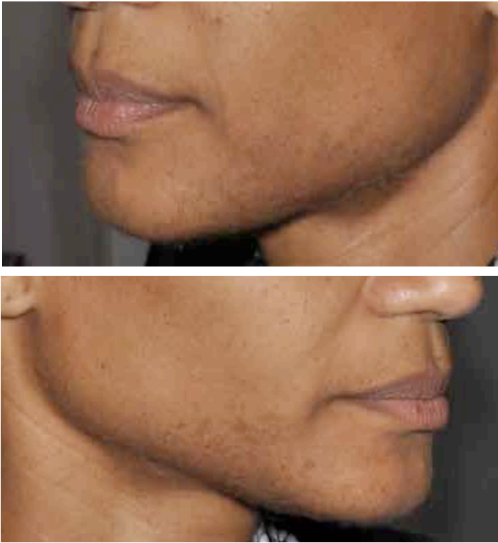
Figure 8. Case 2. One and a half months after the second treatment (4 September).