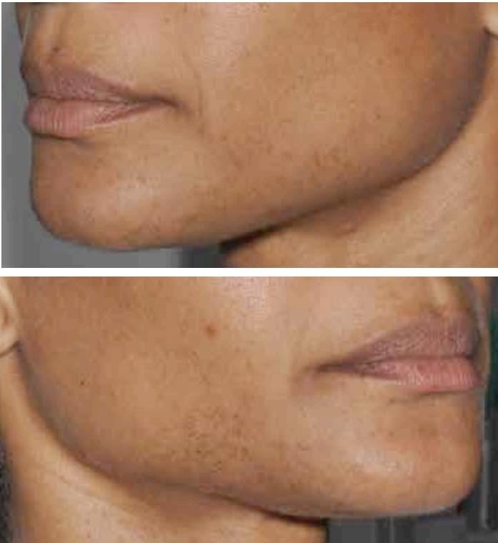
Figure 9. Case 2. One and a half months after the third treatment (26 October 2015).

CASE 3: Patient (phototype III) with normal hair at the groin level. Given that this patient had a very low pain threshold, the choice went to the Moveo alexandrite