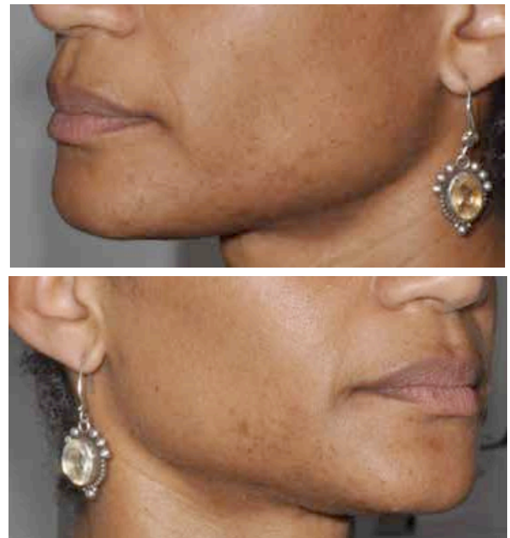
Figure 7. Case 2. One and a half months after the first treatment (12 June).