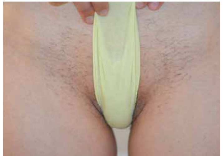
Figure 10. Case 3. Before treatment, June 2015.

The patient felt a little heat, but did not need to interrupt treatment. Two sessions were performed, the first in June and the second at the end of July. The patient returned in December (after 5 months) for a third session. However, the follow-up at 5 months revealed that the results in terms of reduction in hair quantity and thickness and delayed regrowth had been maintained.